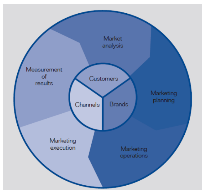
Fig. 1: The Marketing Framework

In another hand, the notion of accountability is an amorphous concept that is difficult to define in precise terms. However, broadly speaking, accountability exists when there is a relationship where an individual or body, and the performance of tasks or functions by that individual or body, are subject to another's oversight, direction or request that they provide information or justification for their actions. Therefore, the concept of accountability involves two distinct stages: answerability and enforcement [3].